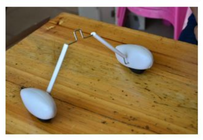
Install the assembled landing gear into the pre-cut slot on the bottom of fuselage.